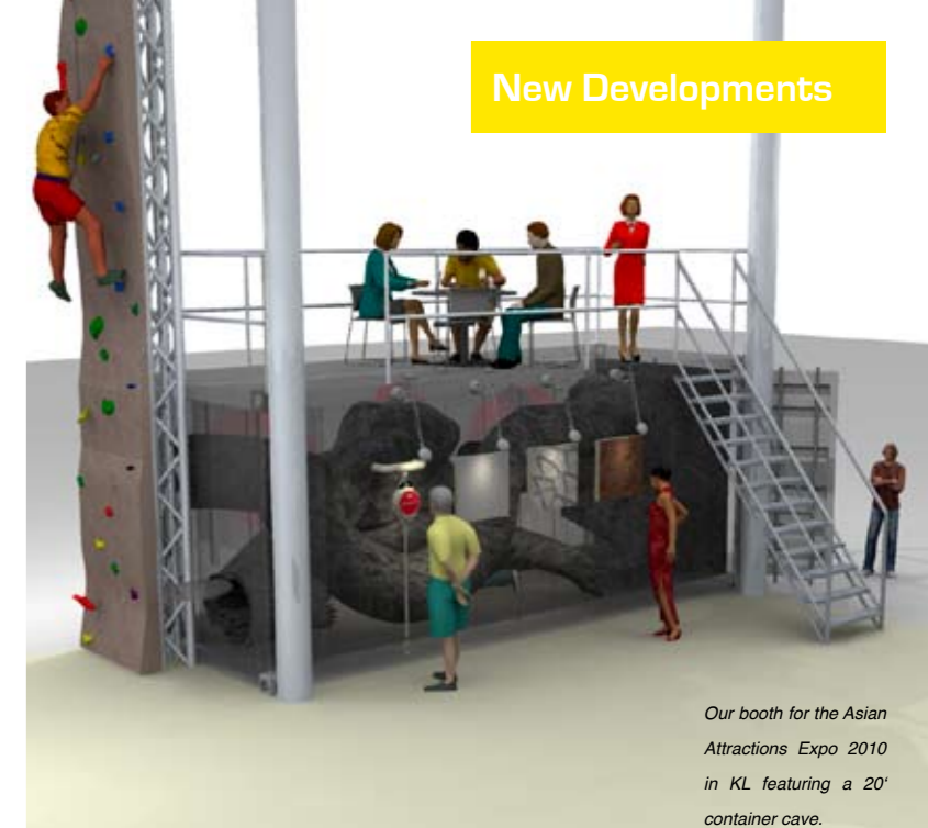
Our booth for the Asian Attractions Expo 2010 in KL featuring a 20' container cave.